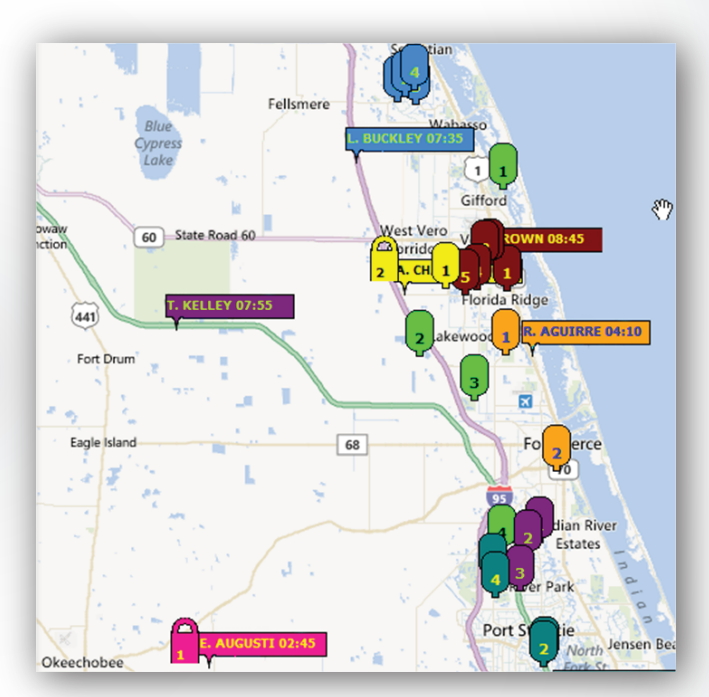
Geo-spatial mapping provides an intuitive "drag and drop" interface for scheduling, routing and tracking